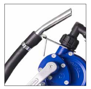
Hose holder with 13 056