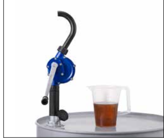
Positioning of the spout to avoid any spills